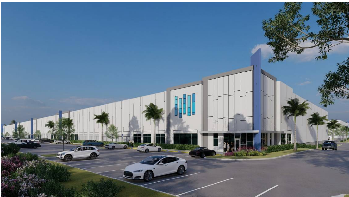
Barron Collier Companies and Imminent Ventures have begun construction of the Manatee County Logistics Center, a 563,451-square-foot Class-A industrial park on the southwest corner of U.S. 301 and 44th Avenue East.

“Over the years, the Barron Collier Companies has grown from a land holding company to one of the largest diversified companies in Southwest Florida, with business ventures including extensive agricultural operations, commercial and residential real estate development, and oil exploration and mineral management,” the company website says.